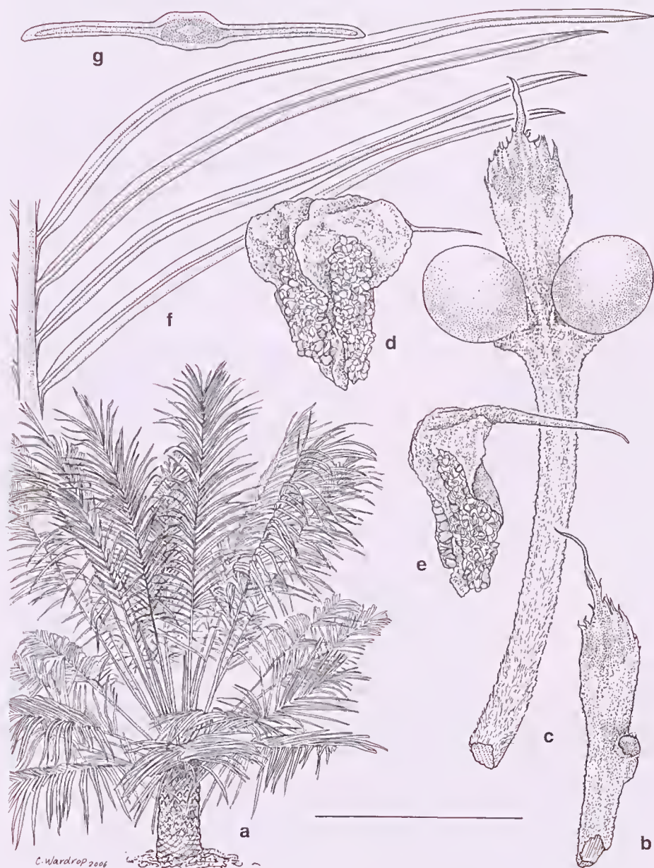
Fig. 6. Cycas nitida . a, sketch of habit (from digital image of S.J. Walkley cult. plant). b, immature female sporophyll (from NSW 728765). c, mature sporophyll (from NSW 731813). d, e, male sporophyll (d, e, from NSW 728767). f, part of leaf. g, cross-section of leaflet (f, g, from NSW 728765). Scale bar: a = no scale, b,c = 6 cm, d,e = 2 cm, f = 10 cm, g = 1 cm.